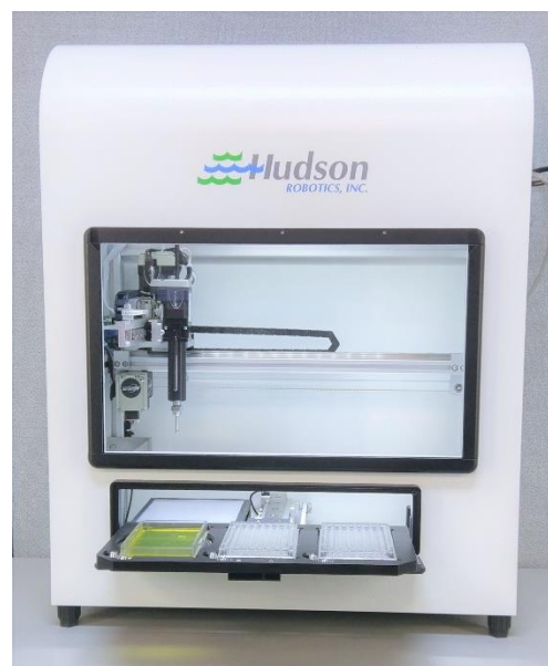
The RapidPick™ SP

Harvester: Provides aspiration of colonies, for use with semi-solid media.