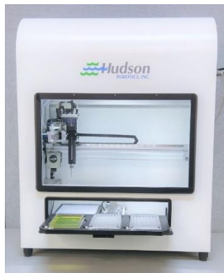
The Single-Pin RapidPick™ SP