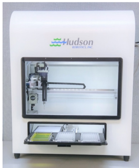
The RapidPick SP

Harvester: Provides aspiration of colonies, for use with semi-solid media.