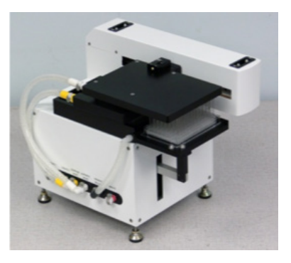
...and Standard Plates