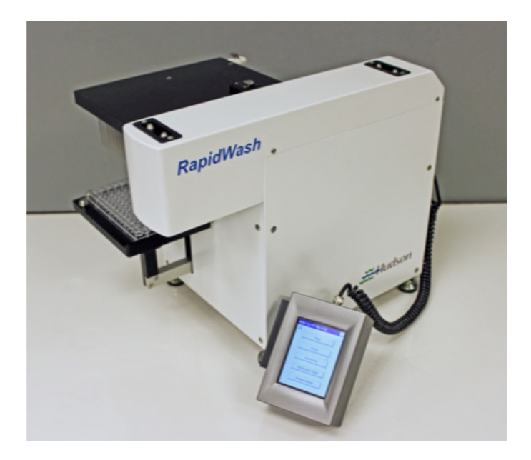
RapidWash Plate Washer